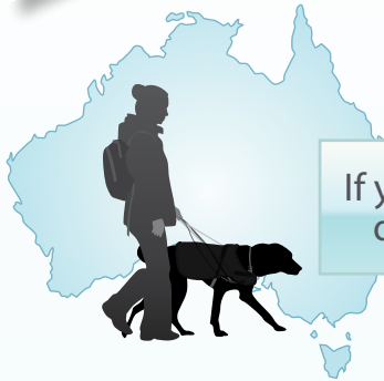
Disability can affect anyone, anytime